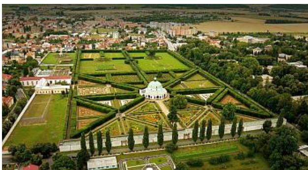
Kroměříž: Archbishop's Château, the Flower Garden and the Château Garden. UNESCO World Heritage

We do not provide transport of participants to the conference. Possible connections by public transport see http://jizdnirady.idnes.cz/vlakyautobusy/spojeni