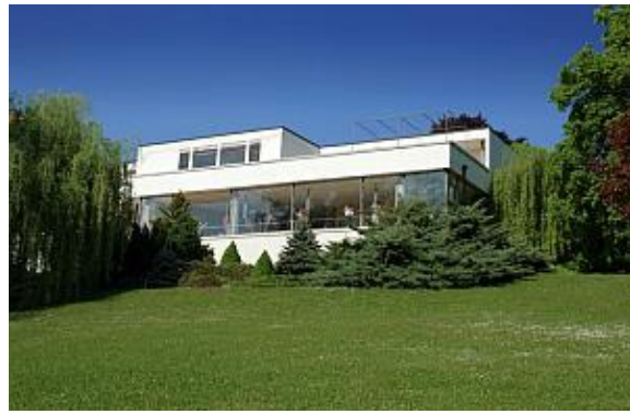
Brno, Tugendhat Villa – a part of the UNESCO World Heritage