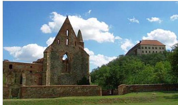
Dolní Kounice: ruins of the Rosa Coeli convent and the castle

The reservation of accommodation is the matter of participants. We recommend Grand Hotel Brno (4 stars) which is situated in the favorable transport position just opposite the railway station where train and bus connections as well as buses from the airport terminate; Barceló (5 stars), which is the most luxurious of them and Boby Centrum (4 stars) situated in walking distance from the University. Usual price of the accommodation in a four-star hotel is about 70 EUR per a single or 100 EUR per a double room in September depending on the particular hotel, room type, time and method of ordering, and so on.