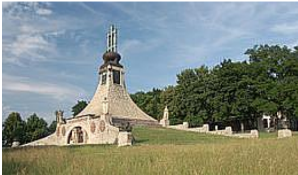
Austerlitz battlefield: The Cairn of Piece Memorial

no return (a substitution of person is possible)