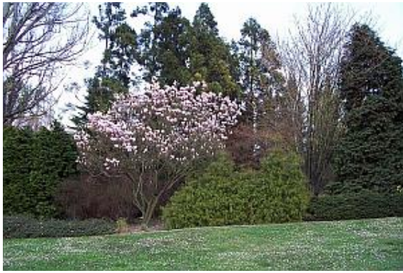
Mendel University in Brno, the Arboretum