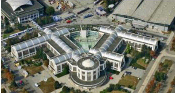
Brno, Fair grounds