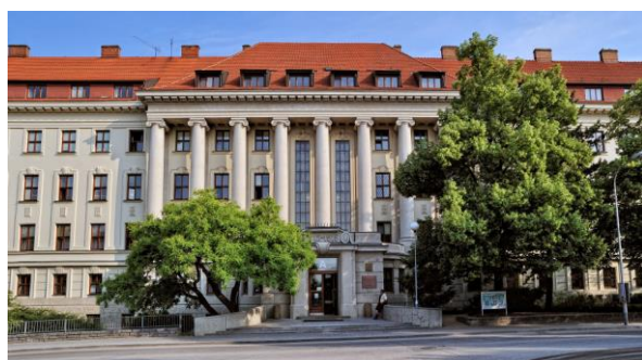
The main building of the Mendel University in Brno (built 1915)