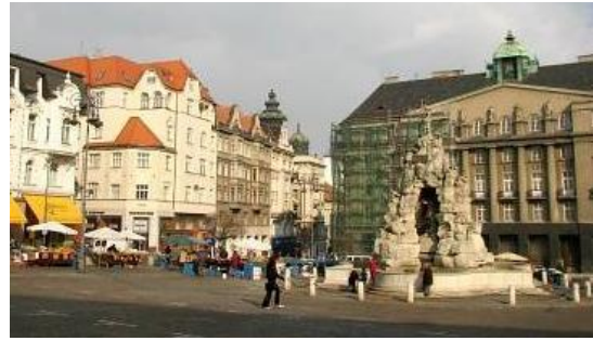
Brno, Cabbage Market