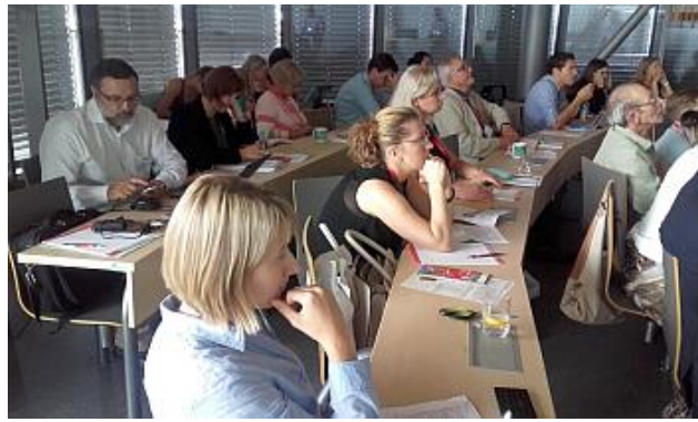
Participants of the EURORURAL '16 Conference