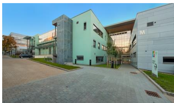
The "M" building, where the conference will take place

Please, register on http://www.eurorural.eu/ till June 20, 2018 (despite you have completed the preliminary registration form). In the case of technical problems, contact directly the conference organizers (see below).