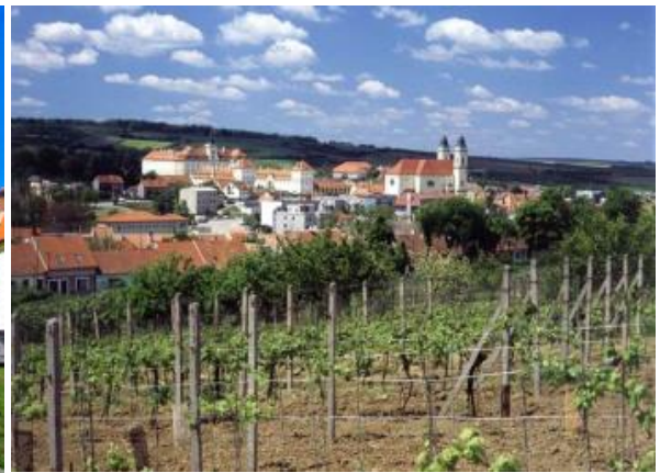
Viniferous South Moravia