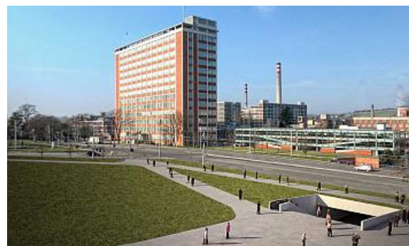
Zlín: The administrative building of the Baťa company